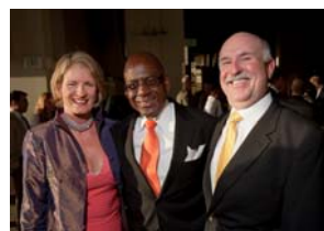
March My Big Greek Roast Invesco Field at Mile High Denver, CO