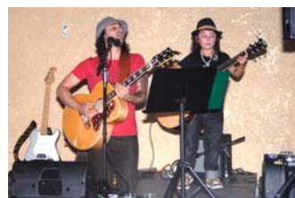
August Kiss The Bluz Goodbye, Cocktails for A Cause City Park Pavilion, Denver, CO